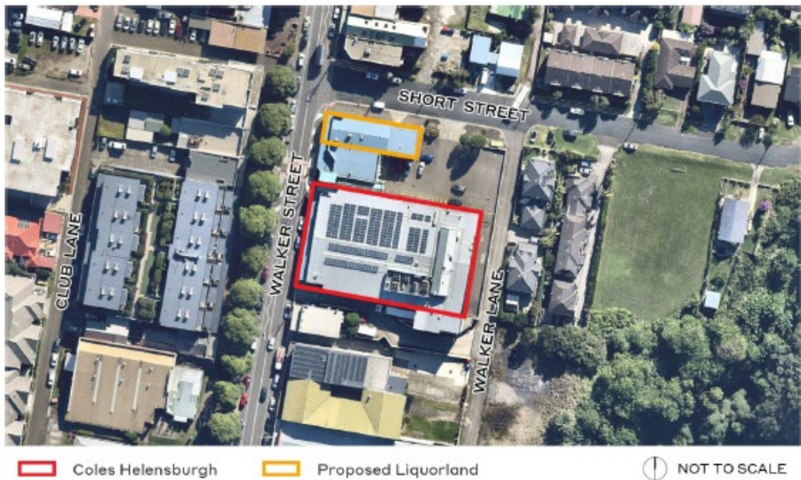
Local site map with proposed premises- Source: Nearmap and Ethos Urban, 2021