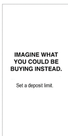
Digital advertising example execution

For dynamic digital advertising, such as online banner advertising and digital display advertising amongst others, the tagline and call to action must replicate the format of the example execution. The tagline and call to action must be placed at the end of an advert, in the final frame (not the beginning, which was also tested). The tagline must be presented as black text on a white background to allow the viewer to easily read it, and ensure the messaging stands out from the advert. No other messages or images are to appear on the screen at this time.