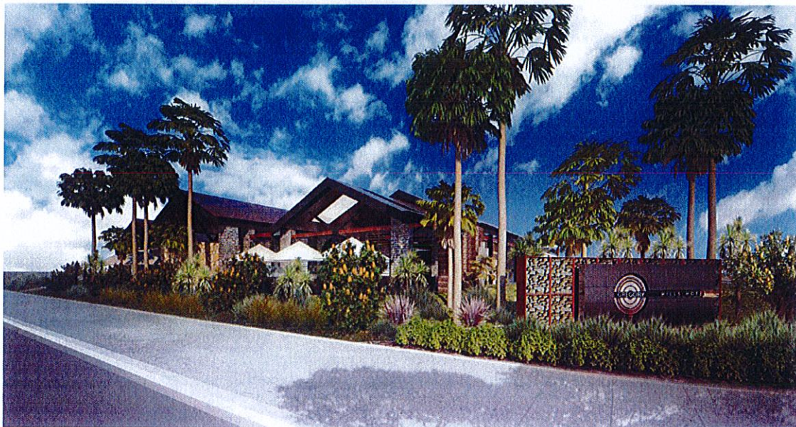
Artist's impression of Gregory Hills Hotel

Gregory Hills Hotel (LIQH440018968) January 2016