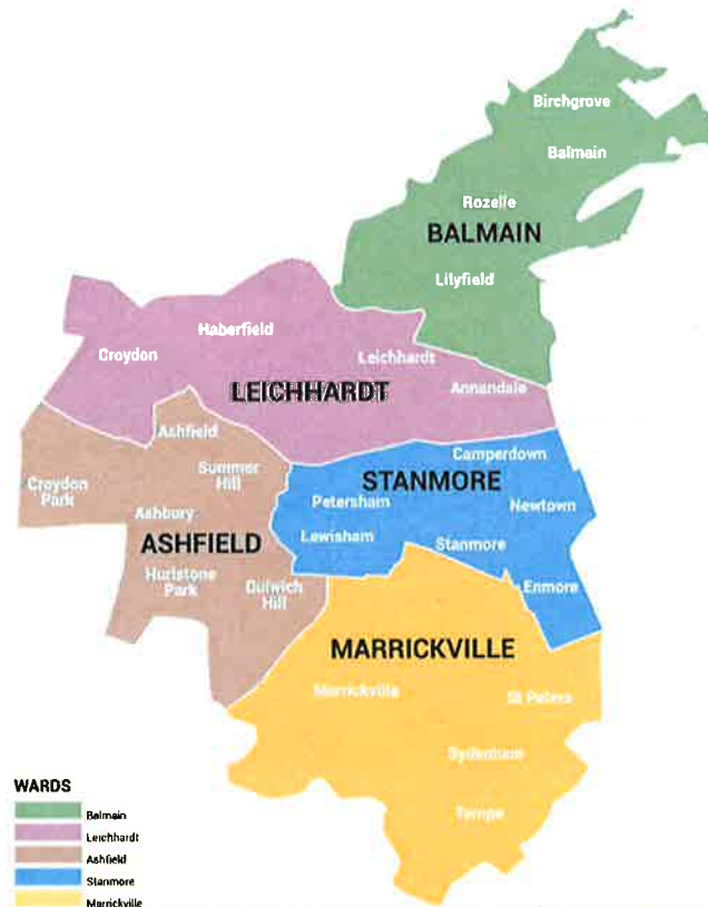
Inner West Boundary Map – wards colour-coded